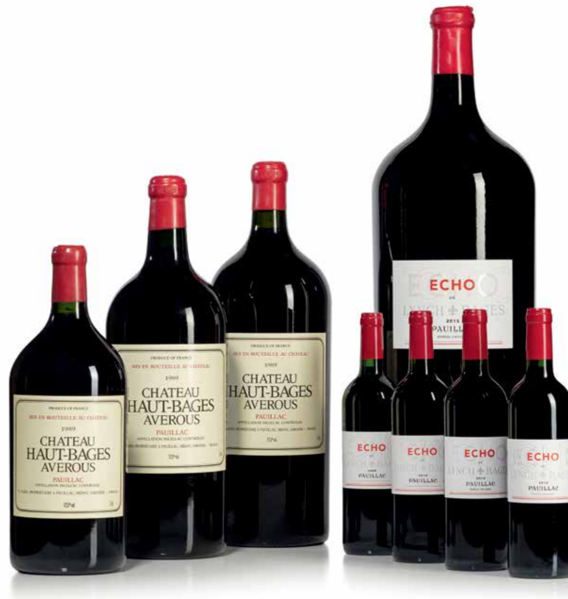
LOTS 309, 311, 315