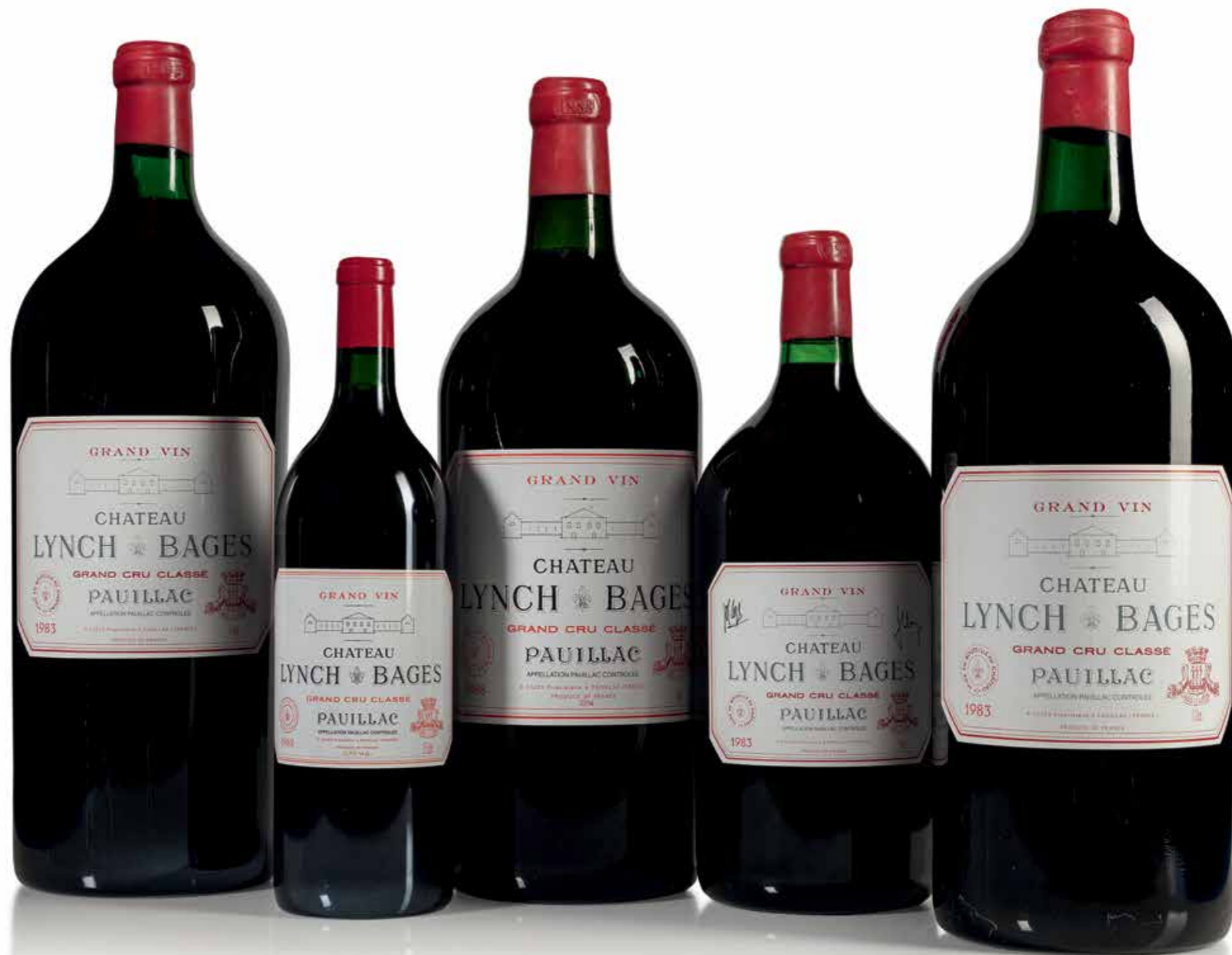
LOTS 249, 250, 265, 269, 278