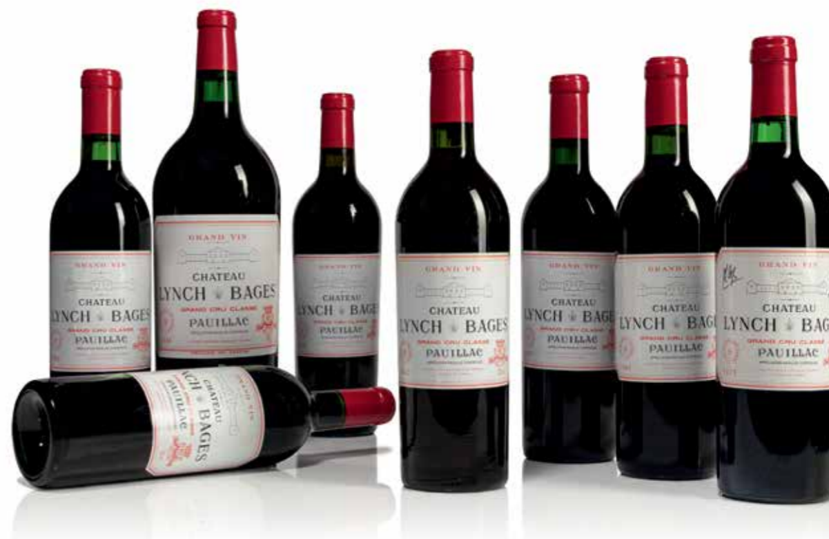
LOTS 298, 299, 300, 302, 304, 306, 307, 308