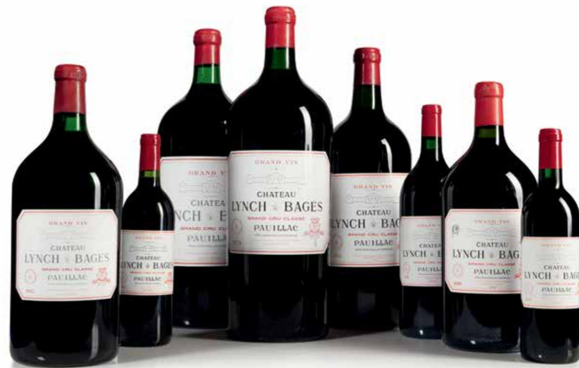
LOTS 257, 262, 273, 278, 290