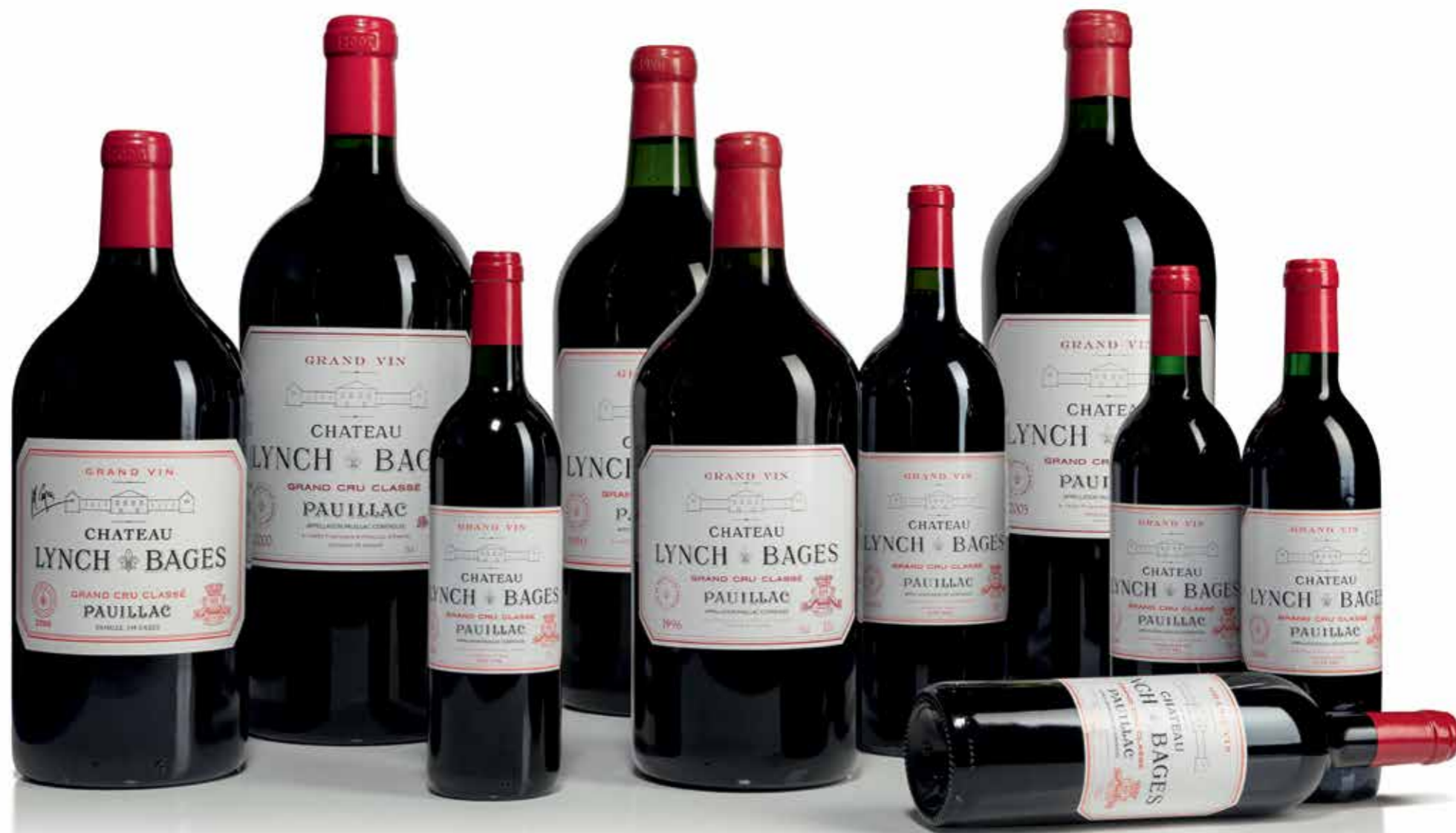
LOTS 1, 5, 21, 33, 35, 40, 68