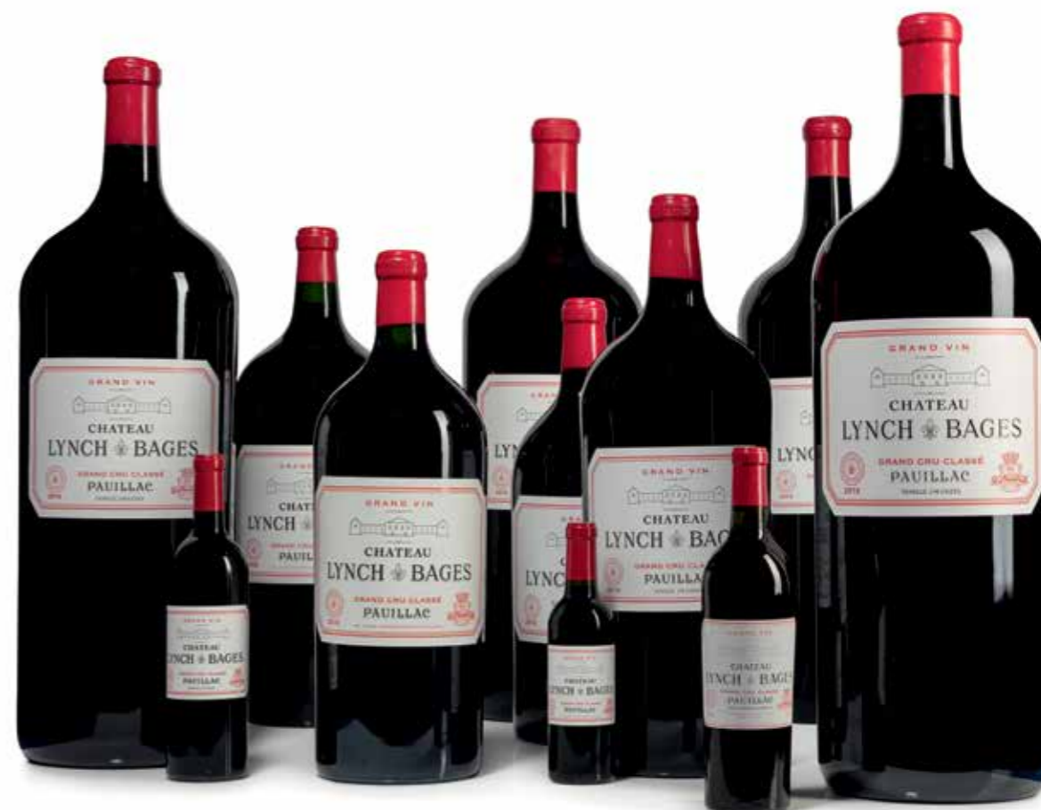
LOTS 136, 142, 148, 190, 192, 239, 308

per lot: £4,000-5,500 per lot: $5,000-7,000 per lot: €4,800-6,500