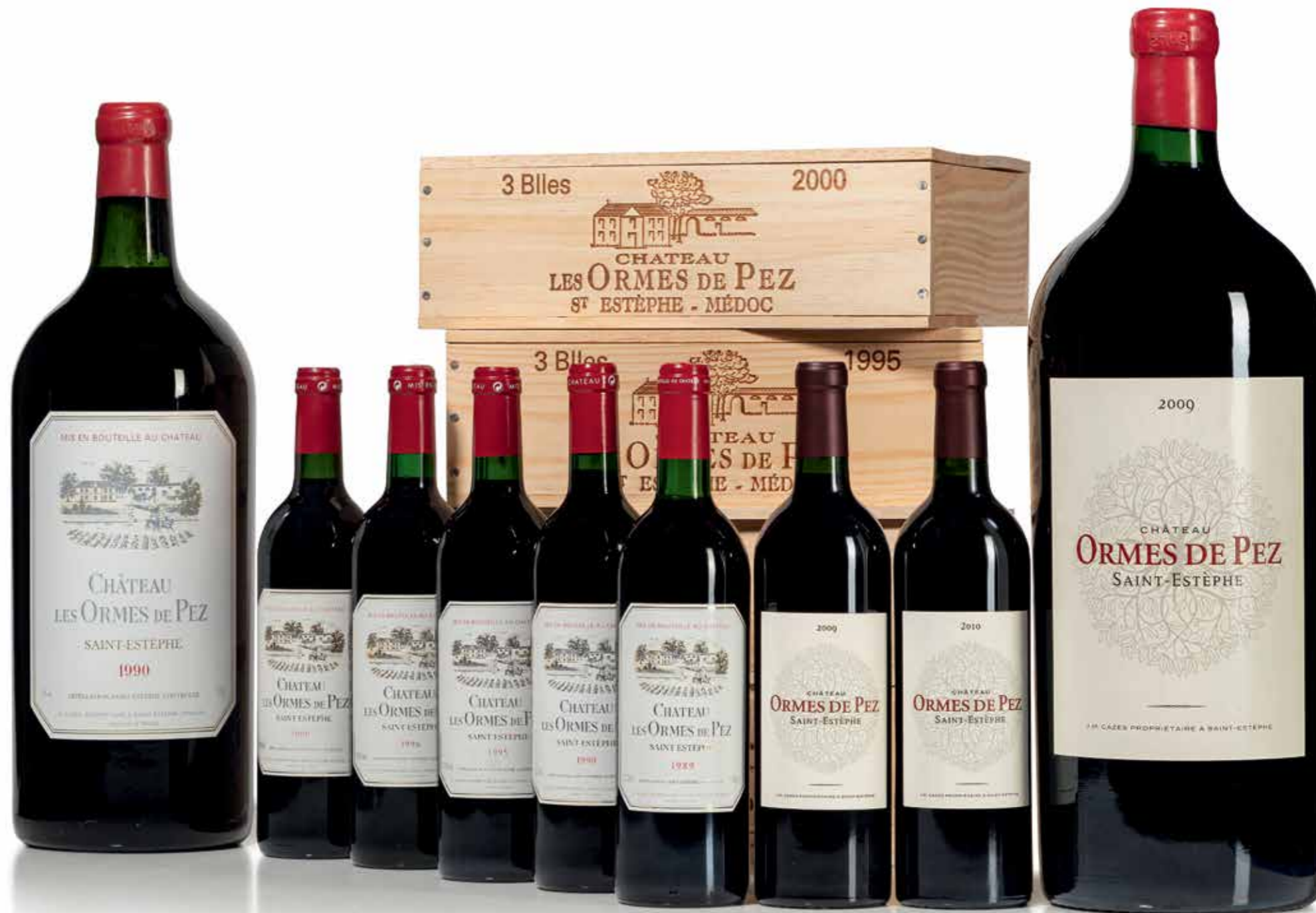
LOTS 326, 329, 331