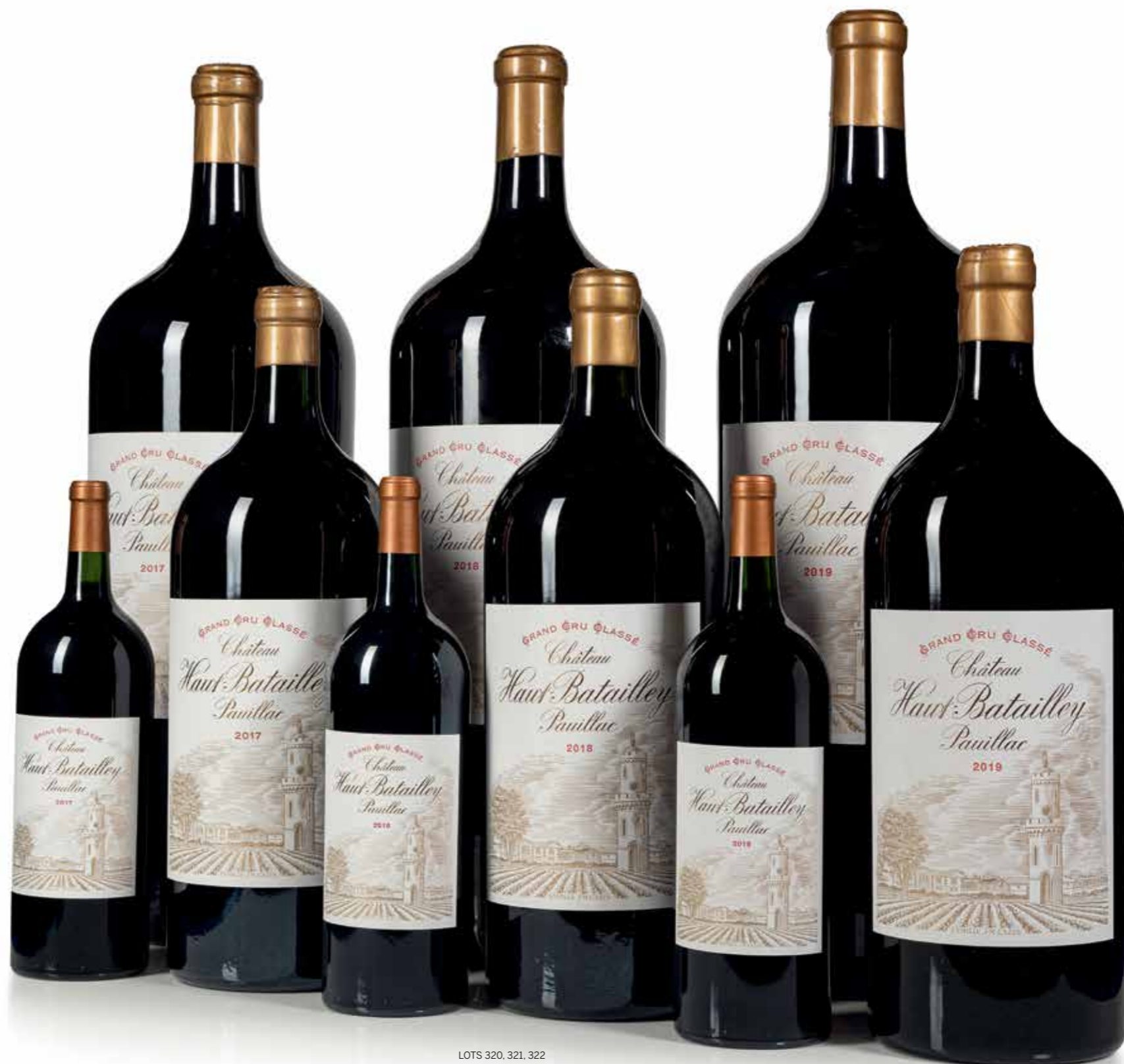
LOTS 320, 321, 322